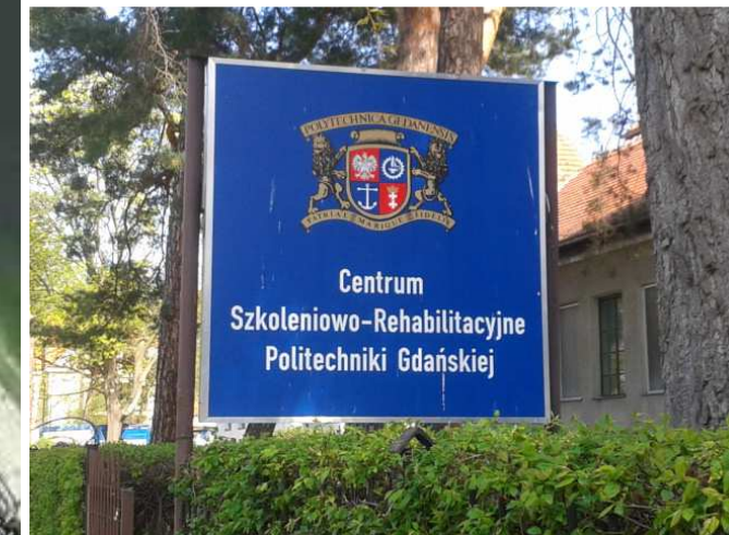
Training and Rehabilitation Center of Gdańsk University of Technology